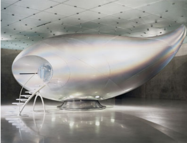
Mariko Mori, WaveUFO , 1999–2002, brainwave interface, vision dome, projector, computer system, fiber glass, Technogel®, Acrylic, carbon fiber, aluminum, magnesium, 16' 2 1/8" x 37' 2 7/16" x 17' 3 7/8". Installation view.